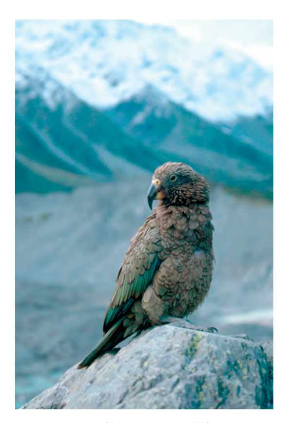
kea (Nestor notabilis)