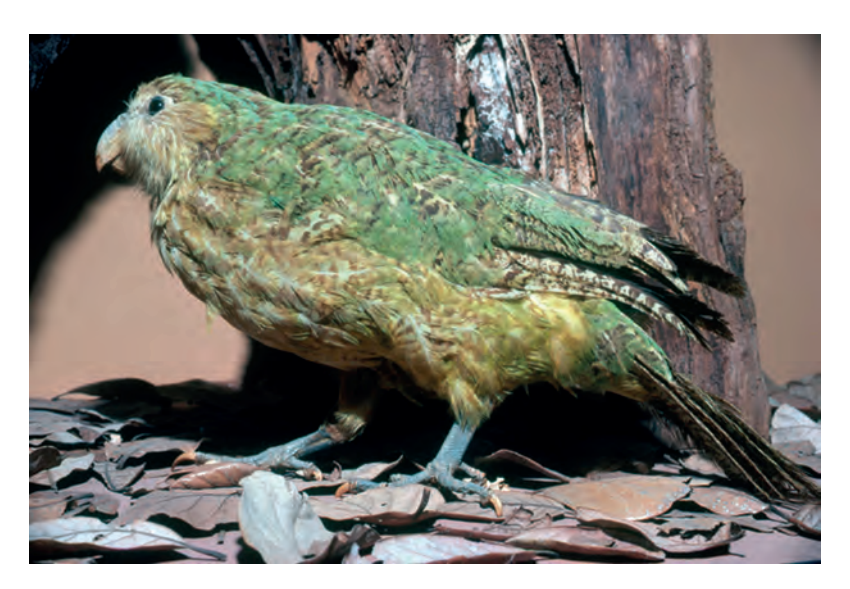
kakapo (Strigops habroptila)